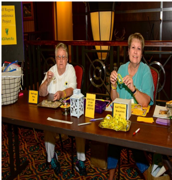
Sisters Assisted with Registration and Altruistic Sales