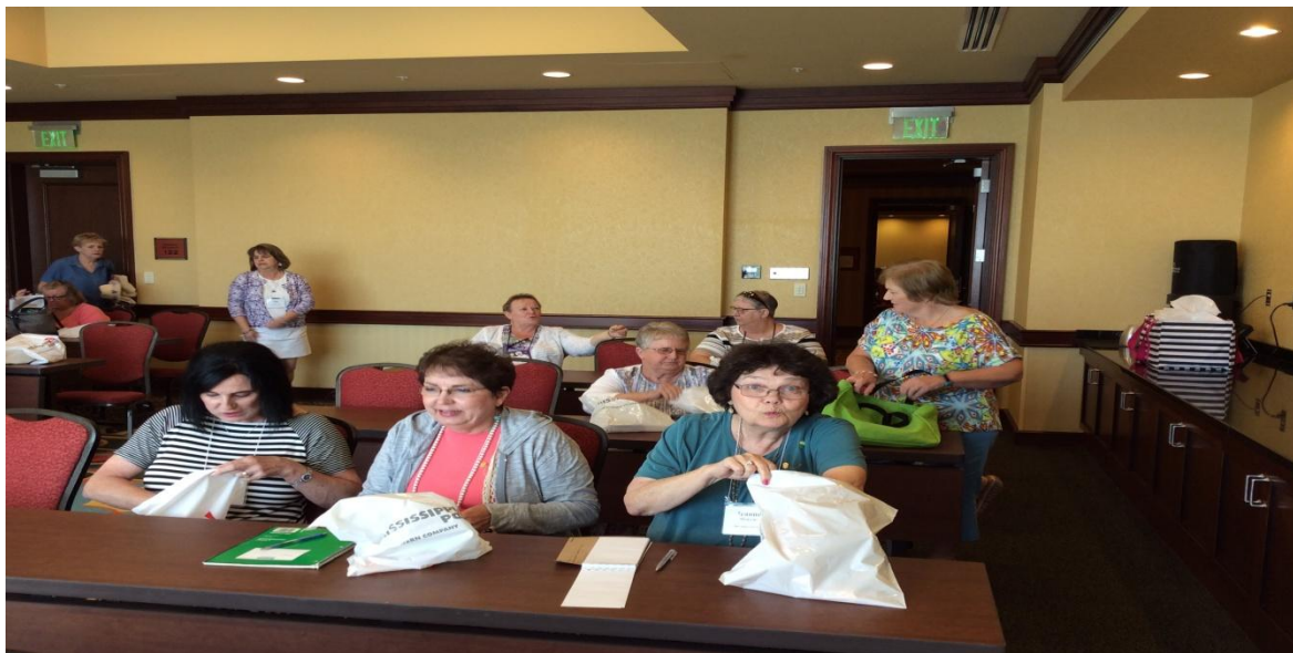
Mississippi sisters held a State meeting and shared information and ideas.